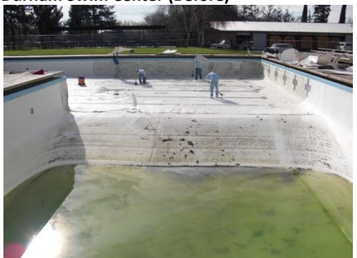
State Contractor's License Board Information