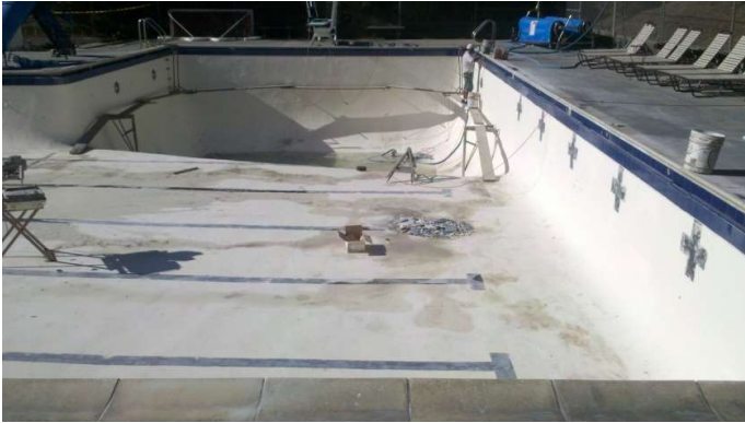
Highlands Recreation District Pool (before)