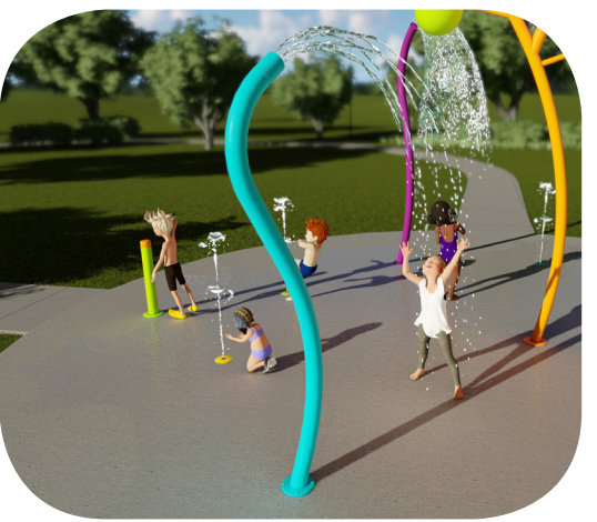
Mission Hill Shower™ W326-2C