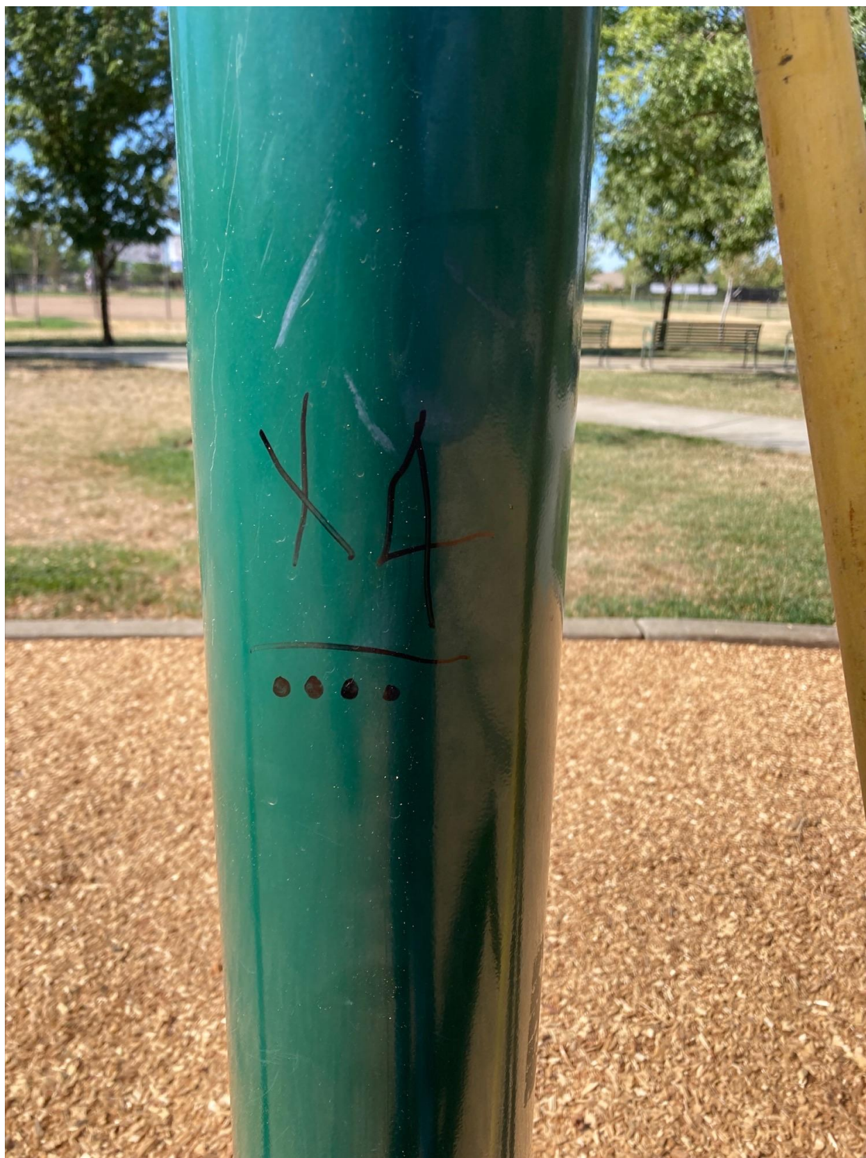
Eufay Gang Graffiti on 8/3/22 (Took place between 8/2/22 – 1630 and 8/3/22 – 0950)